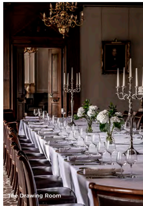
The Drawing Room

When the night is over why not stay in one of our beautifully appointed guest bedrooms, complete with period features and contemporary comforts?