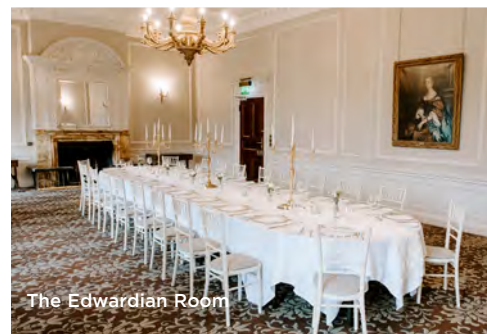
The Edwardian Room